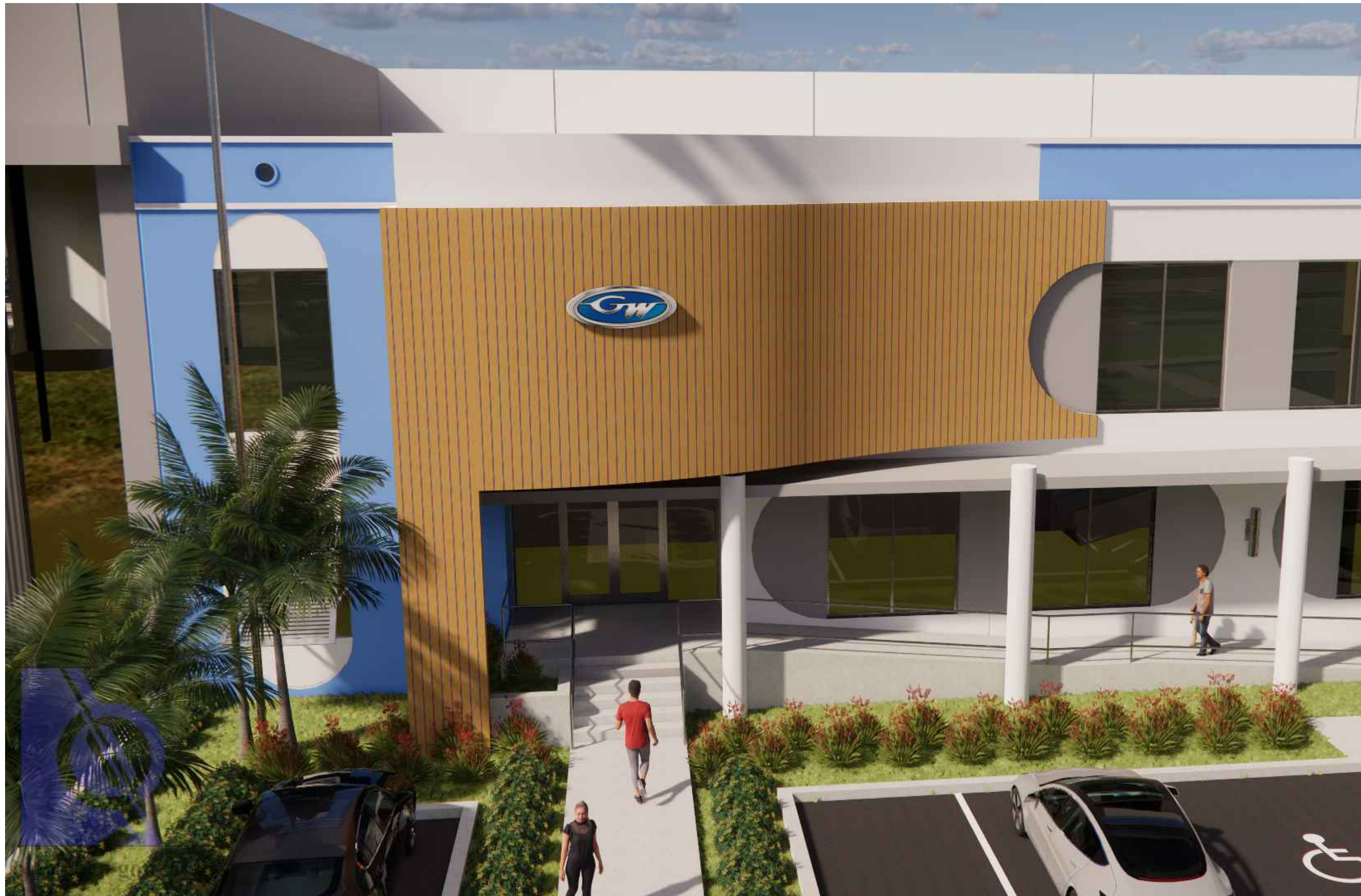
C4 MAIN ENTRY VIEW NOT TO SCALE