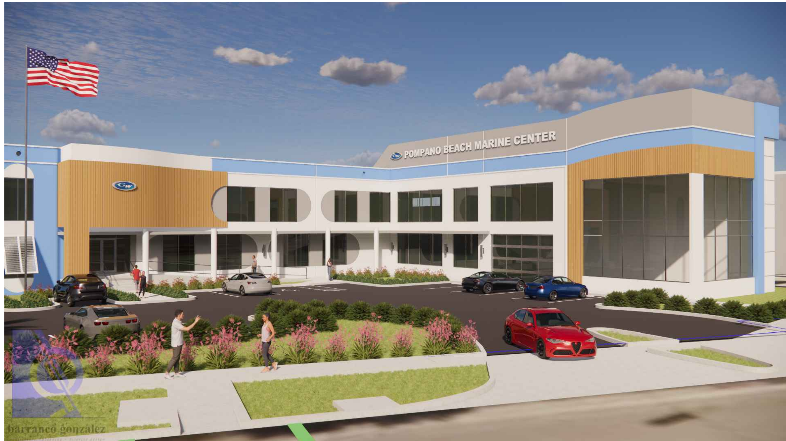
A1 RETAIL SHOWROOM VIEW NOT TO SCALE