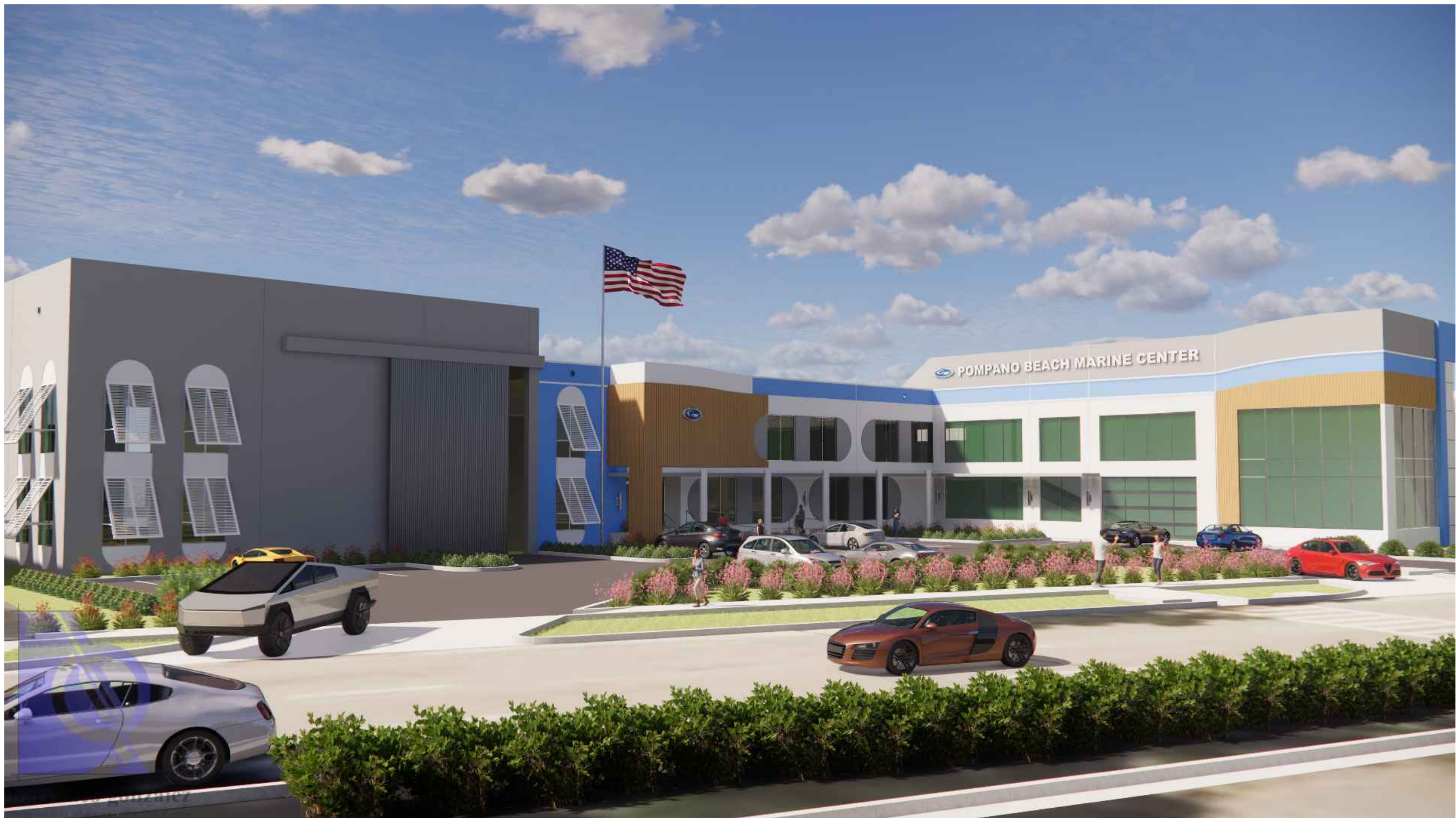
A1 EAST ELEVATION RENDERING NOT TO SCALE