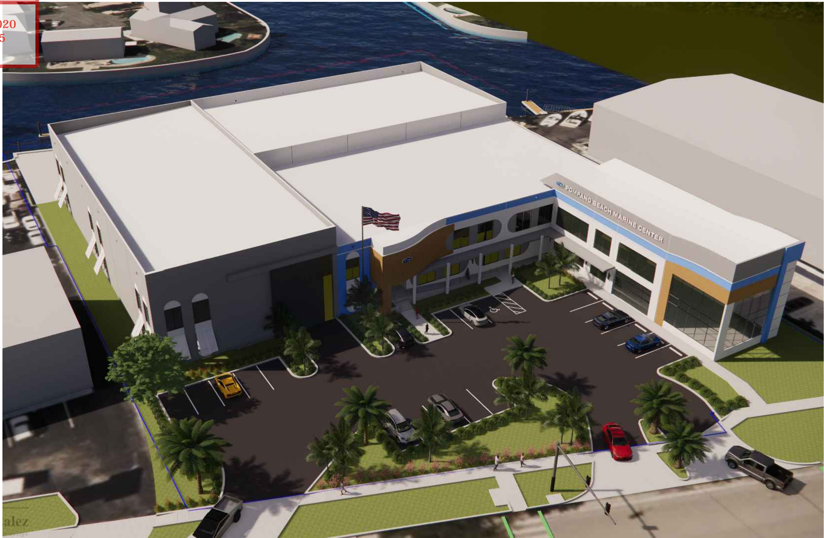
C1 OVERALL SITE RENDERING NOT TO SCALE